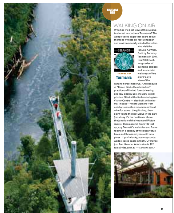
Green Globe Tip - December '09 issue