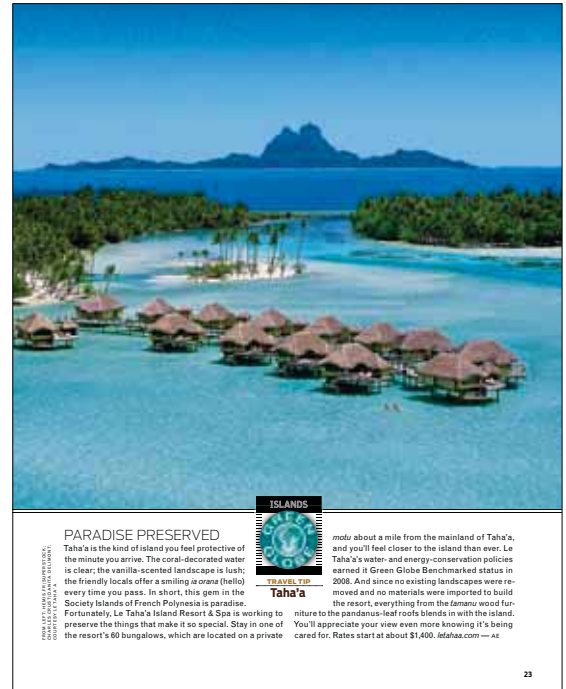
Green Globe Tip - November '09 issue